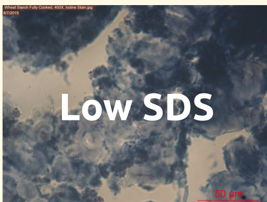
Gelatinized wheat starch showing loss of granule structure.

In raw cereal grains, starch typically occurs in spherical granules with semi-crystalline structure. This structure impedes access to digestive enzymes, contributing to a high SDS content. During cooking, exposure to heat, moisture and/or pressure results in the swelling and eventual rupture of the granules (gelatinization), making them more susceptible to digestive enzymes and decreasing the SDS content of the food by transforming it into RDS.