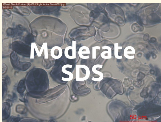
Swollen wheat starch granules during cooking.